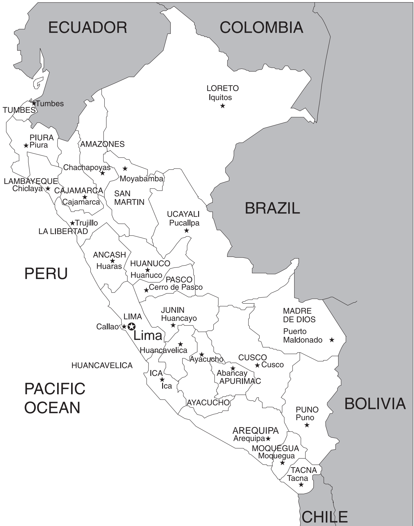
Map of Peru: Departments, 1980s